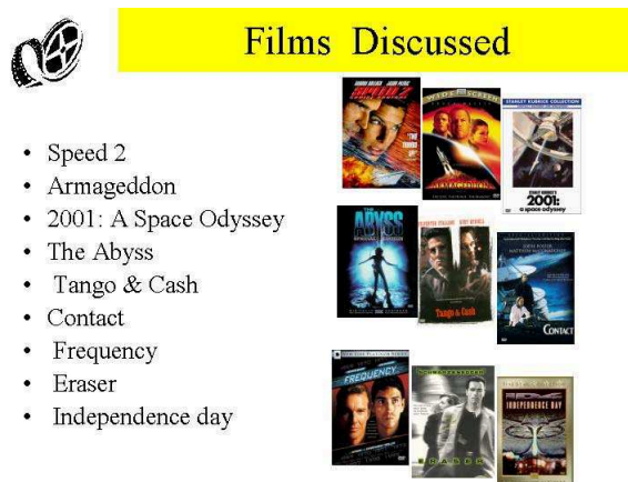
Figure 2: Action and Sci-Fi films used in the original approach of the Physics In Films variation of the Physical Science course.

that first summer. Students were required to watch the films at home and turn in a brief, written analysis of the physics principle illustrated in each of three scenes of their own choosing (homework!). In class, five to ten percent of the class (of 90) were called upon each day to orally present their analysis of one scene to the class. Both the written and oral analyses became part of their grade in the course.