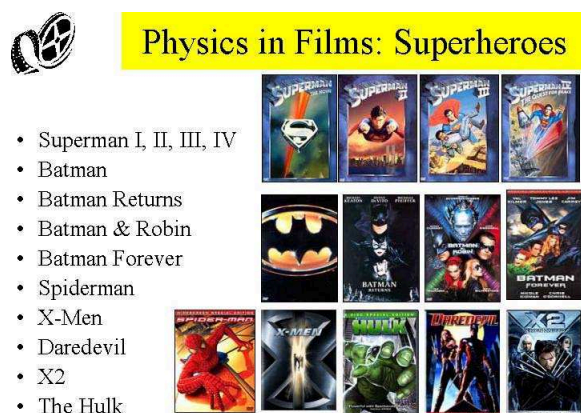
Figure 5: Superheroes films used in the superhero approach of the Physics In Films variation of the Physical Science course.

Encouraged by the enthusiasm of the students, the authors decided to take the project to the next level by considering possible extensions of the course that would accommodate the curiosity of every student and would satisfy the needs of every instructor. Thus, we decided to create versions (packages) —nicknamed flavors —of the course whereby each flavor used a particular genre or theme of movies. As a result, plans were developed to create the following flavors, each using films with a well defined theme: