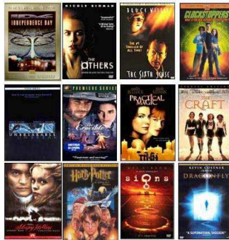
Figure 6: Films with pseudoscientific content used in the pseudoscience approach of the Physics In Films variation of the Physical Science course.

to investigate. The team installed thermal cameras and air movement detectors in the gallery, following which about 400 palace visitors were asked if they could feel a “presence” in the gallery. The response was quite amazing: more than half reported sudden drops in temperature and some said they sensed a ghostly presence. Several people claimed to have seen Elizabethan figures. However, the team discovered that the experiences could be simply explained by the gallery’s numerous concealed old doors. These exits are far from draught-proof and the combination of air currents which they admit cause sudden changes in the room’s temperature. In two particular spots, the temperature of the gallery plummeted down to 36° F. “You do, literally, walk into a column of cold air sometimes,” said Dr Wiseman. Convection is one of the three ways heat propagates; the other two are conduction and radiation. Convection appears in fluids that have a non-uniform distribution of temperature. As a result, currents inside the fluid will be such as to attempt to restore a uniform temperature. These currents are stronger when the non-uniformity is greater. In the case of the gallery rooms, the convection currents would be felt as cold drafts, similar to those experienced by someone who opens the door of a refrigerator a hot day in summer.